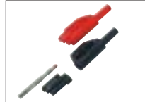
Safety terminal adapter 758931

* Cable B9284LK (light blue) for external current sensor input is sold separately. Safety terminal adapter 758931 is included with the WT500. Other cables and adapters must be purchased by the user.